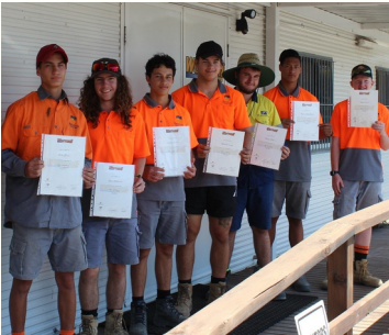
Our graduating students of 2017

We would like to thank everyone involved for their efforts, including site supervisors for making their projects available for work placement when needed and everyone who has assisted in providing a positive learning environment within the company.