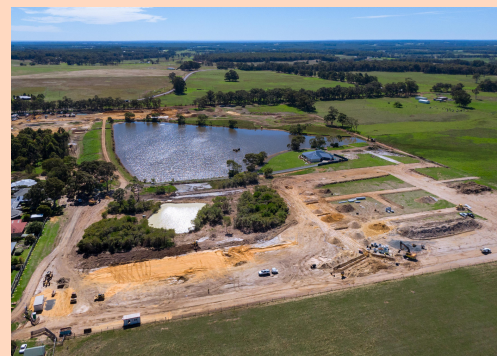
Lake View Estate, Cowaramup