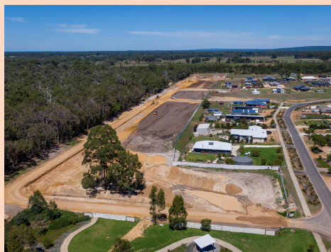
Reserve on Redgate Reserve, Witchcliffe