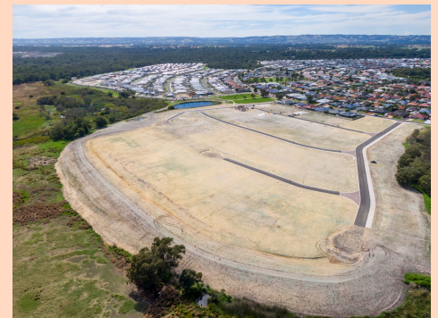
Kingston Estate, Australind