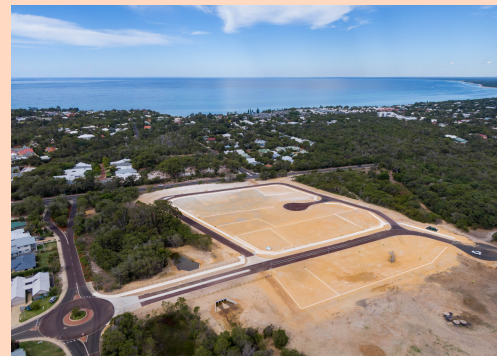
Cape Rise Estate, Dunsborough