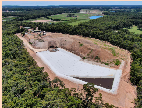
Davis Road Waste Facility, Witchcliffe