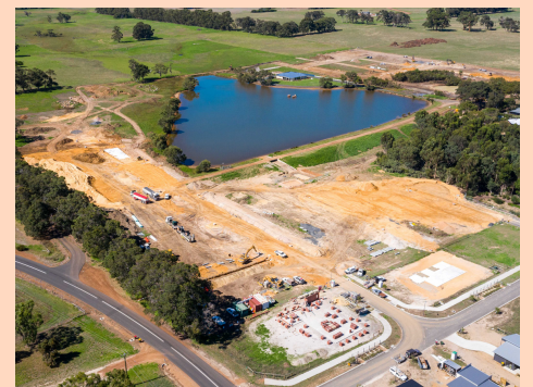
Symphony Waters Estate, Cowaramup