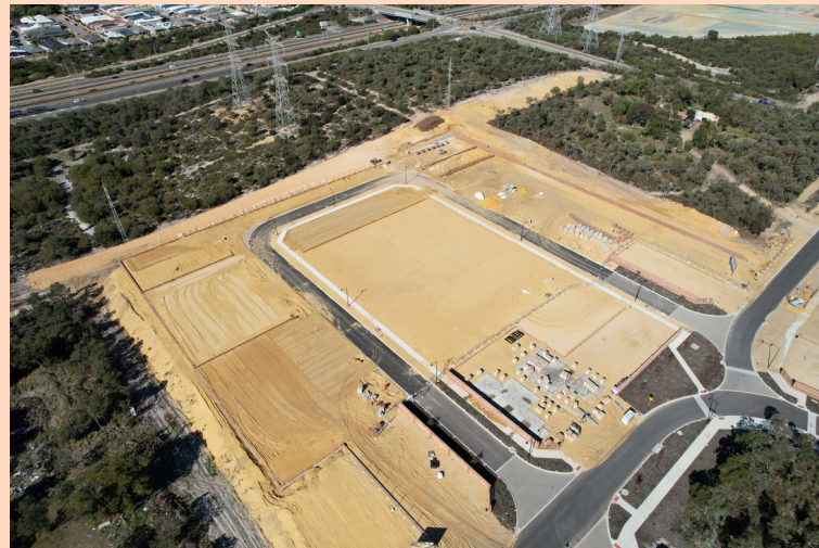
Vivente Estate Stage 9