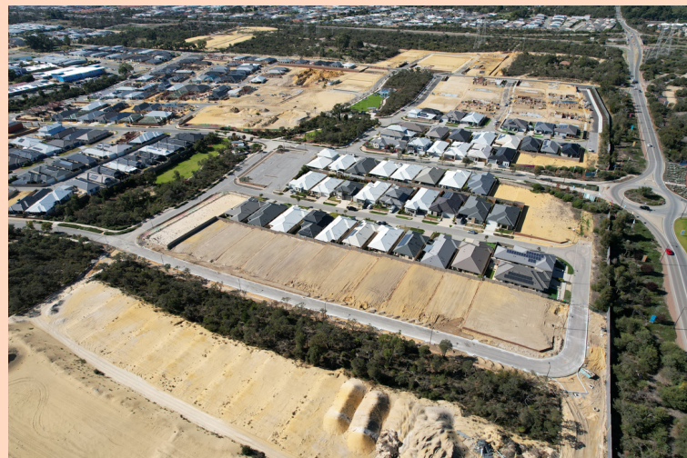
Vivente Estate Stage 12