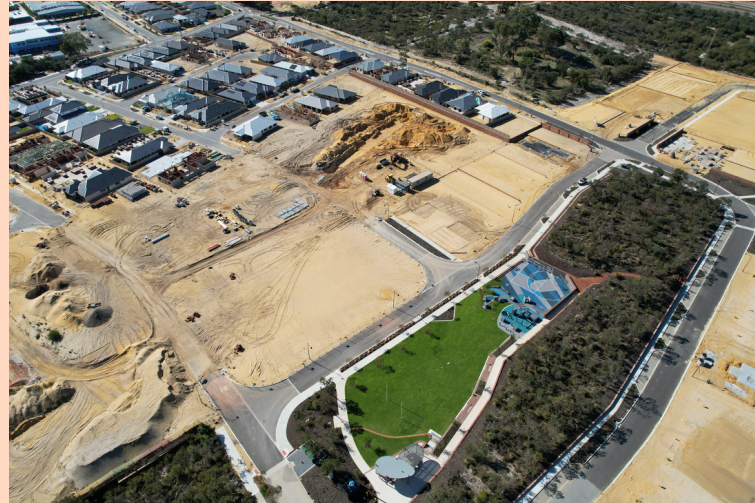
Vivente Estate Stage 6

Stage 6 civil works will release a further 48 fully services lots in September 2022.